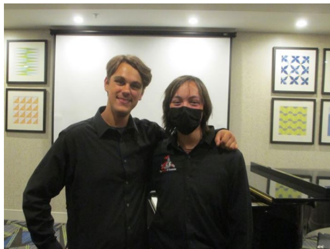
Good, Better, Best Jazz Trio